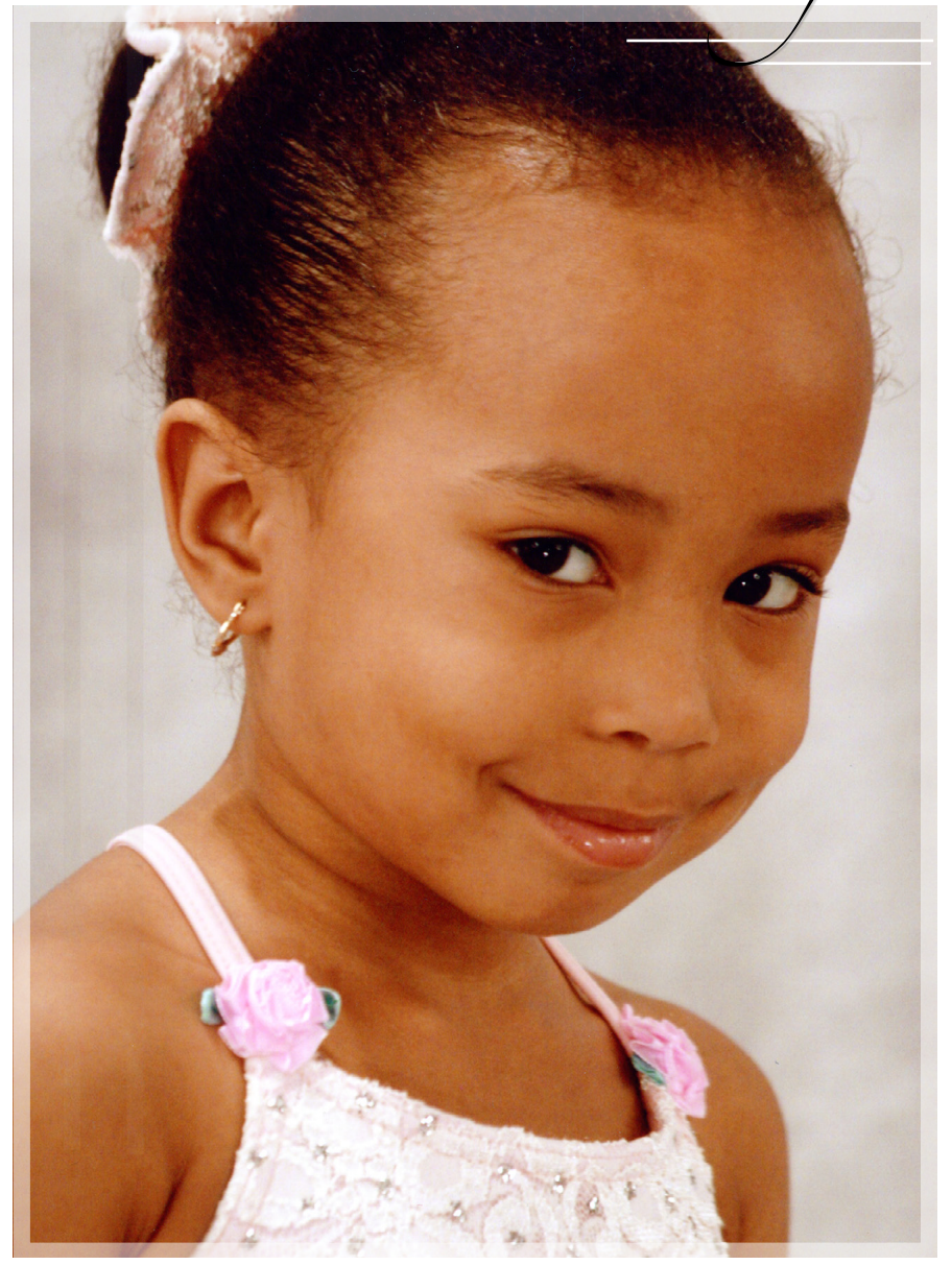
Saturday, March 5, 2011 Journey Christian Church 1965 South Orange Blossom Trail, Apopka, FL 32703