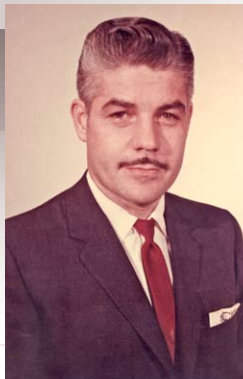
Lieutenant Juvenile Division