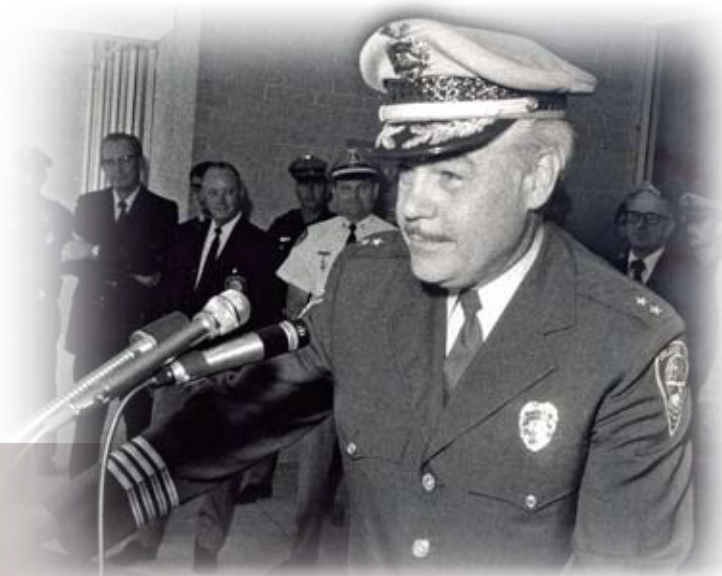
Chief of Police