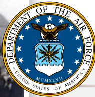
U.S. Air Force