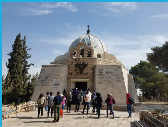
The church at the Shepherds' Field in Bethlehem.

You can now sign up for the Greater Dayton Emmaus Community trip to the Holy Land October 28-November 7, 2019. We will see the places of Scripture, deepen your understanding of the Bible, and walk in the footsteps of Jesus, plus share Communion at Emmaus. There will be optional extensions afterwards, either retracing the Exodus to Mt. Sinai, Cairo, and the pyramids, or go to Jordan, Mt. Nebo, and Petra. The trip will be organized through Educational Opportunities, a travel company that has specialized in Christian trips since 1974.