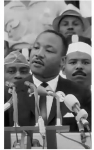
4. Click to watch Martin Luther King Jr.'s Speech