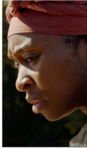
2. Click to watch HARRIET - "Im Going To Be Free Or Die"