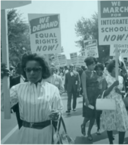
1. Click to watch Oh Freedom! - The Golden Gospel Singers