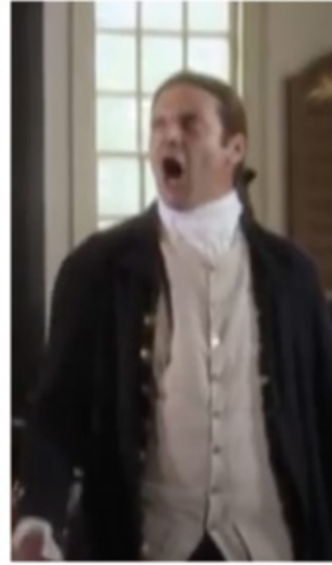
3. Click to watch Patrick Henry's Give Me Liberty Speech