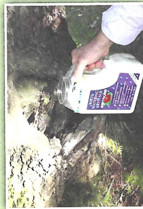
Examine trees for holes or cavities and add water absorbing polymer crystals if needed.

Residents should examine trees on their property for holes, cavities or crotches. These can hold water and provide