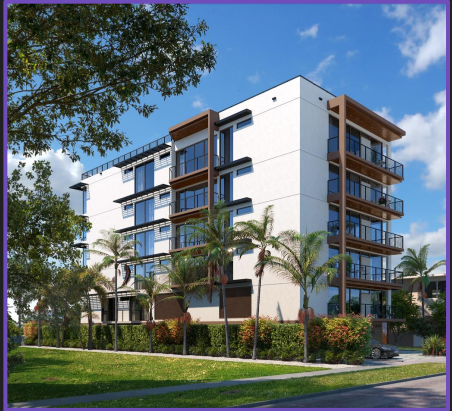
View from Southwest looking Northeast