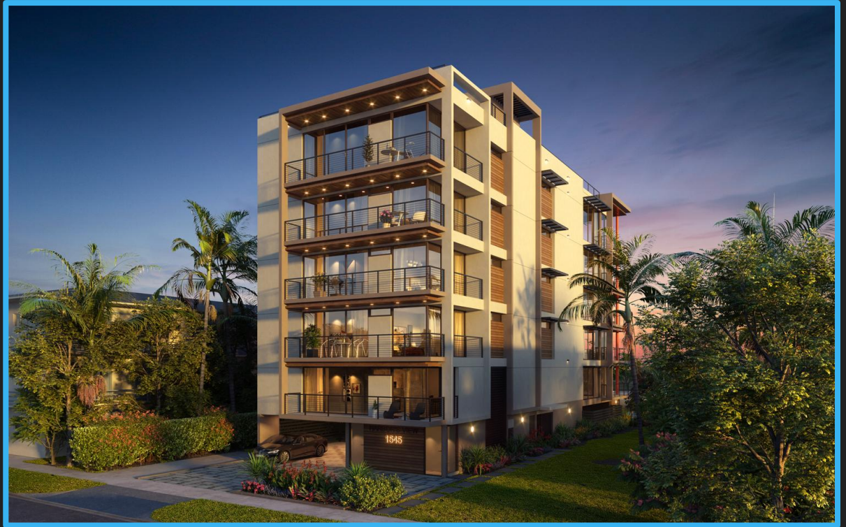
View from Southeast corner looking North

THE FIVE is a new 6- story 5-unit luxury waterfront condominium. This project is located on SE 15th St. minutes from the Intracoastal. Only 1 residence per floor, 4 - 50' boat slips*, 3 parking spaces* per unit, pool - spa, and more !!