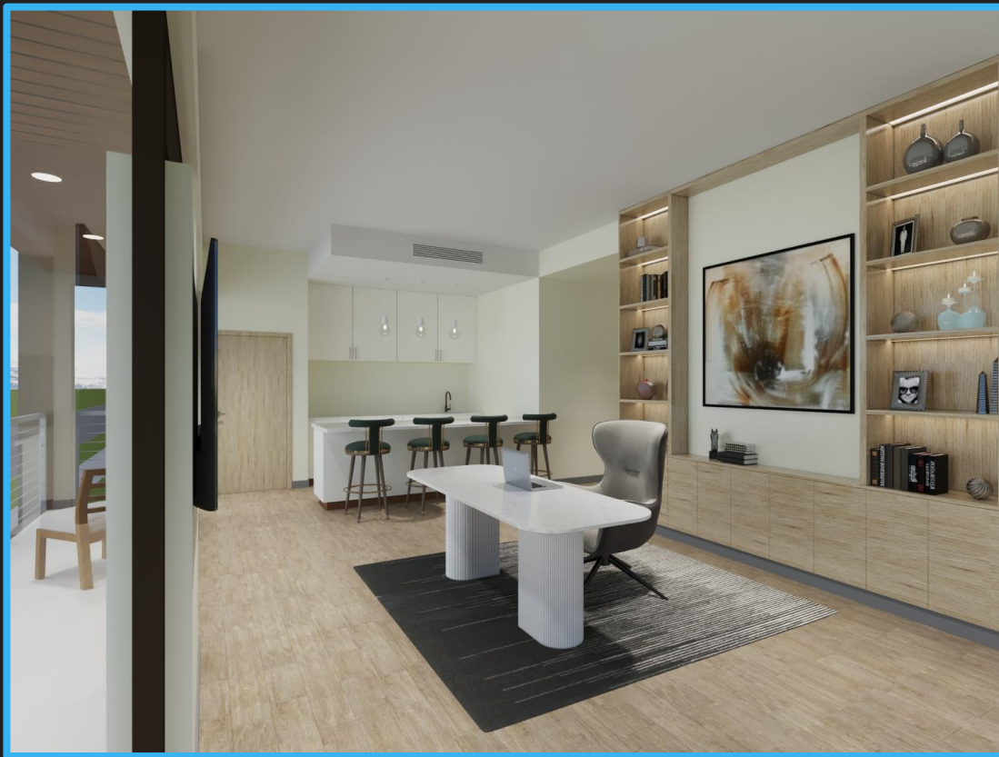
Interior renders featuring European hardwood cabinets