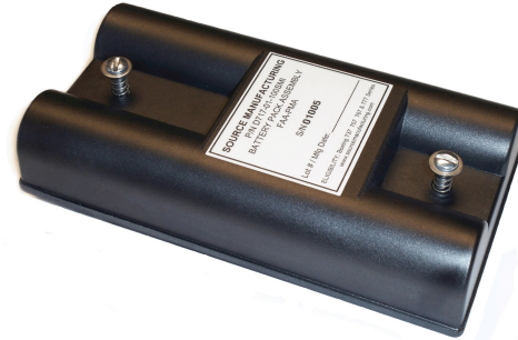
Battery Pack Assembly

Eligibility: Boeing 737 Series, 757 Series, 767 Series, 777 Series, and 777F Series