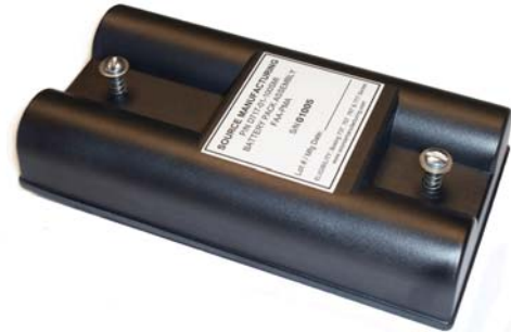
Battery Pack Assembly

Eligibility: Boeing 737 Series, 757 Series, 767 Series, 777 Series