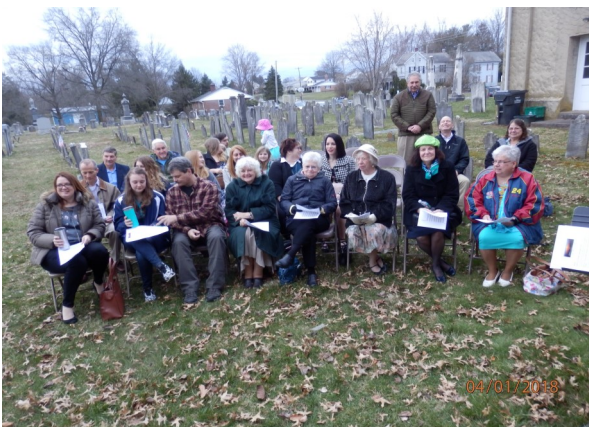
Easter Sunrise Service