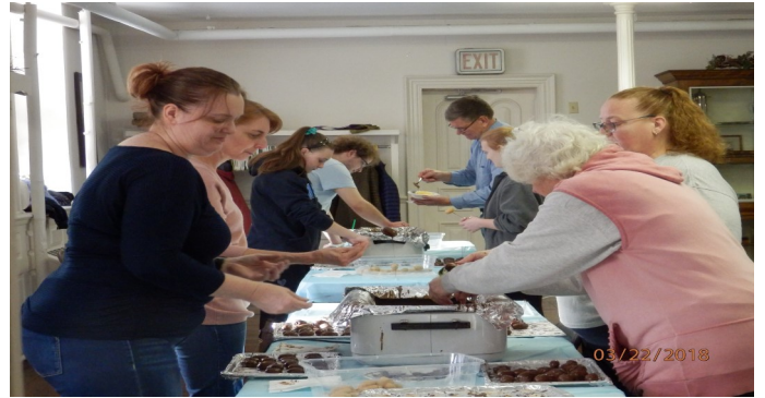
Peanut Butter Egg making