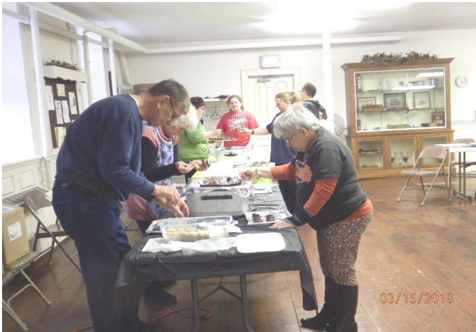
March—peanut butter eggs