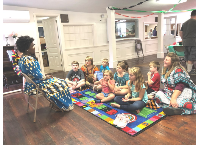
August—A Day in Malawi