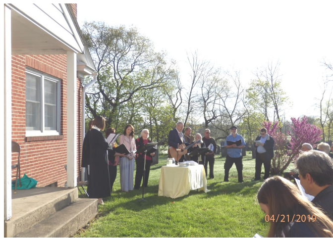
April—Easter Sunrise service