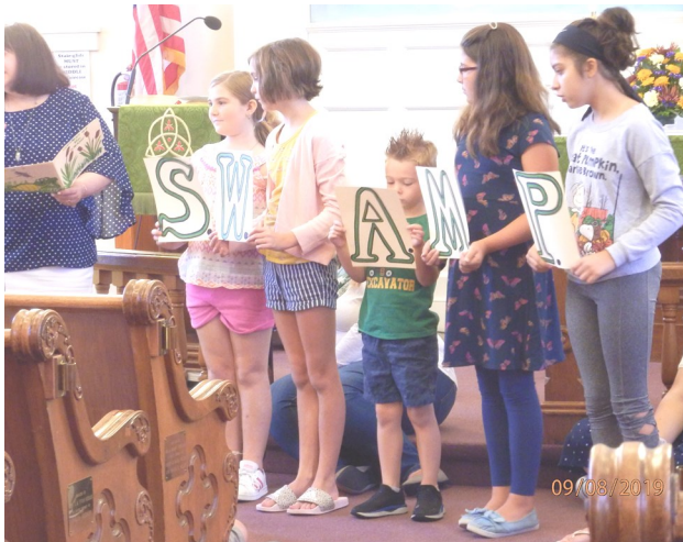
September—introducing Sundays at the Swamp