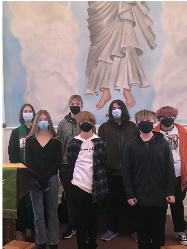
February Voice / Yearbook 2021 Edition