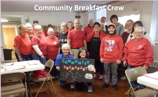
Community Breakfast Crew

(The life of the church in words and pictures.)