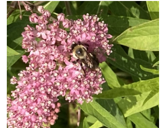
Bee on Joe Pye Weed

The garden is currently wintering over. Bees sometimes spend the winter in the dead stalks of perennials, so we will not cut back the stalks until spring.