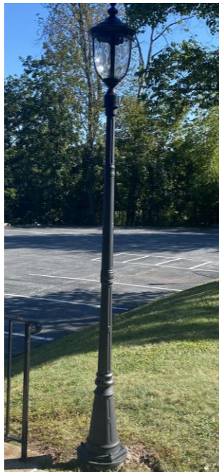
New lamp post