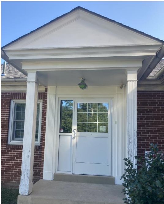
Freshly painted entryway (posts will be completed soon)