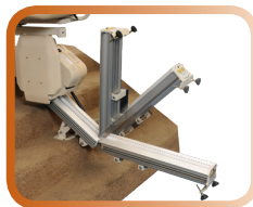
An industry first, automatic fold design eliminates obstructions at the bottom of the stairway. (optional)