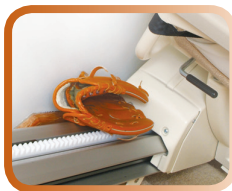
Safety sensors on carriage and platform stop the lift instantly at obstacles.