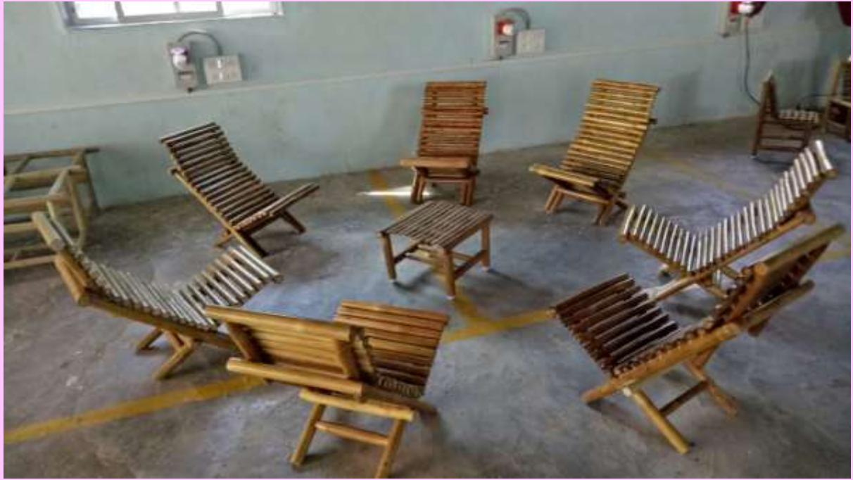
Bamboo Relaxing Chair