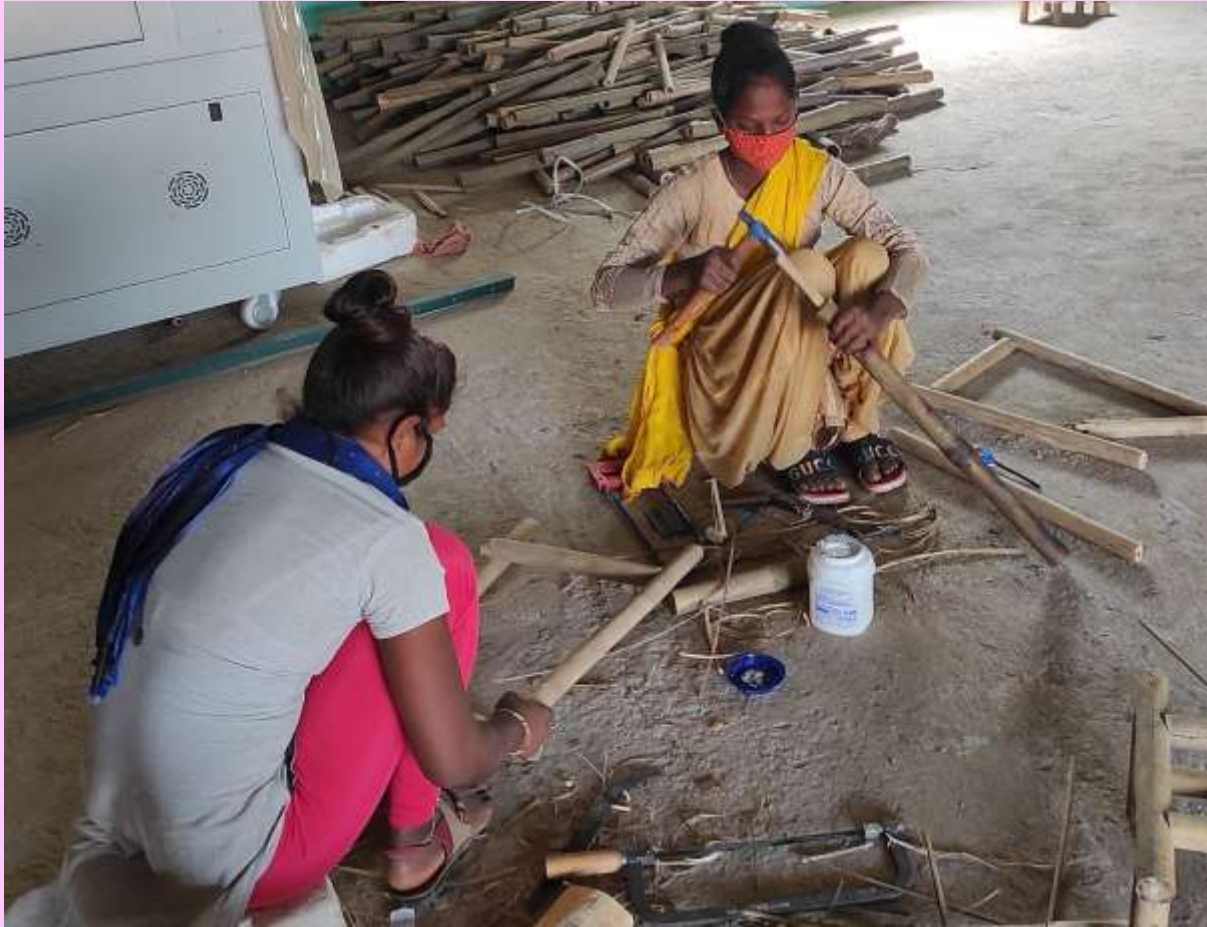
Bamboo Chair Formation Steps

During the financial year 2022-23 Various furniture were prepared and sell to various customers as per on demand in which local women artisan were actively involved in bamboo furniture, are given bellow: