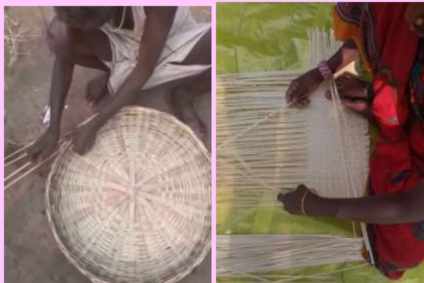
Traditional basket making and new pattern of weaving learnt in the training

These artisans have traditional skills in making bamboo baskets of various sizes and earning about 2000-3000 per month by selling these at local level.