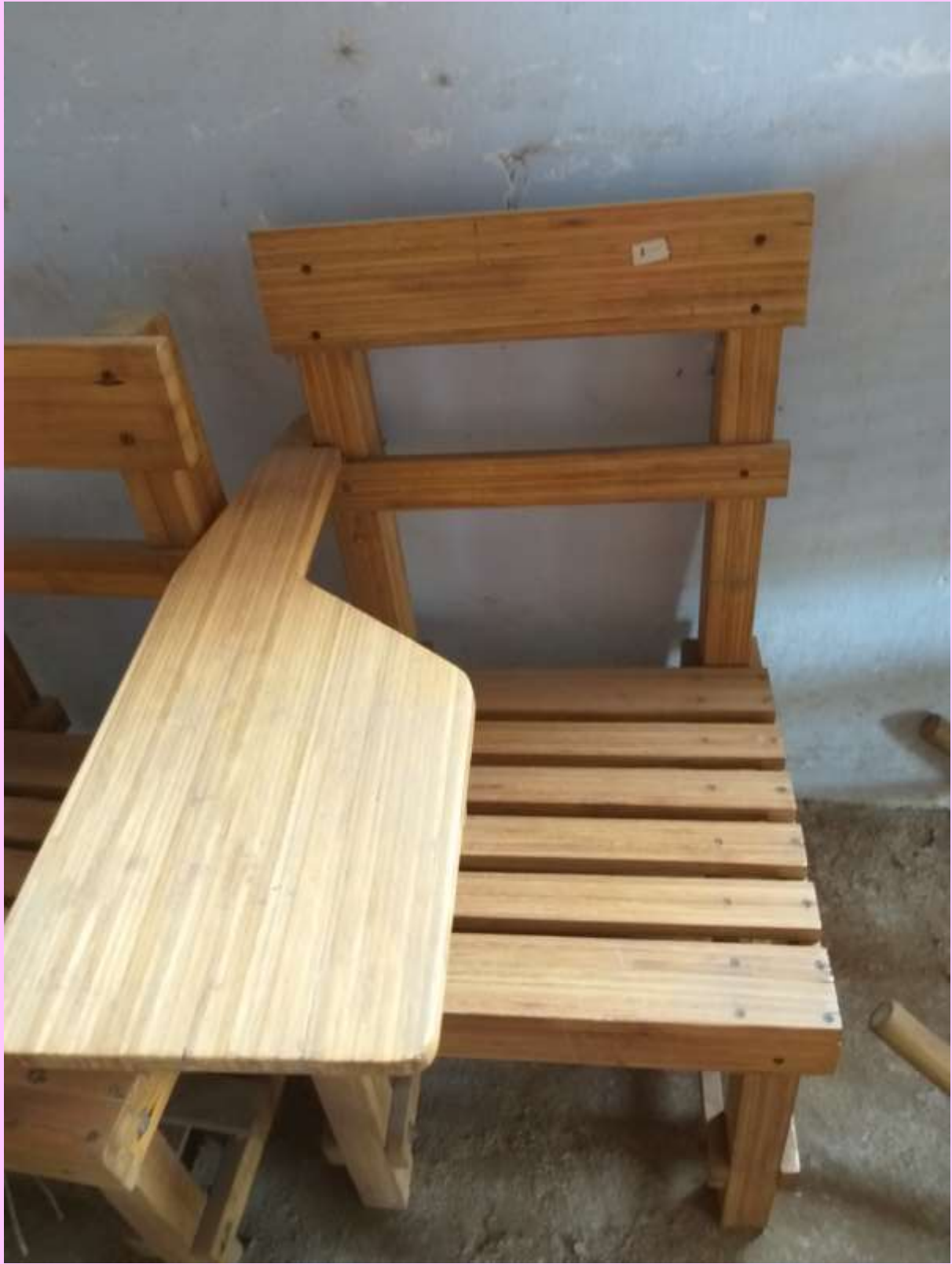
Bamboo School Chair