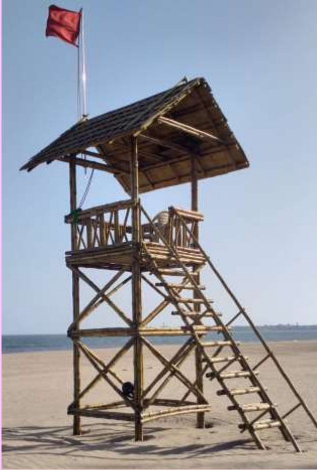
Bamboo Watch Tower