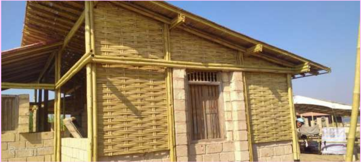
Gaushala at Rajkot, Gujarat