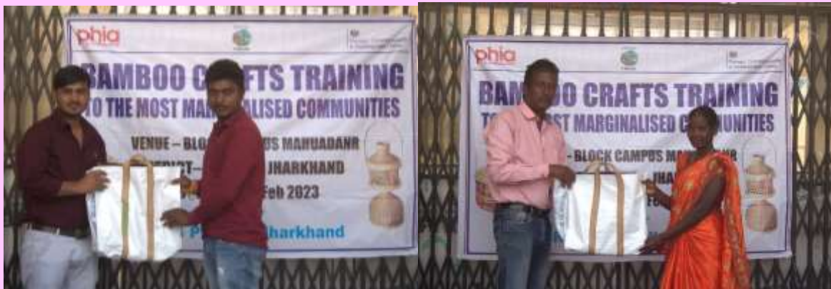
On the last day of the training, every trainee participant received a tools kit set for their home production and making products with uniformity and with better finishing.