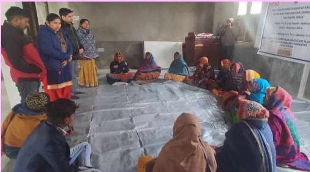
Introduction of Training and Scope of Bamboo handicraft described