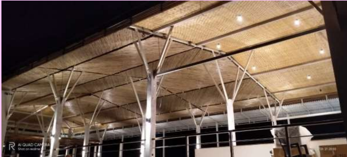
Roofing work at Restaurant