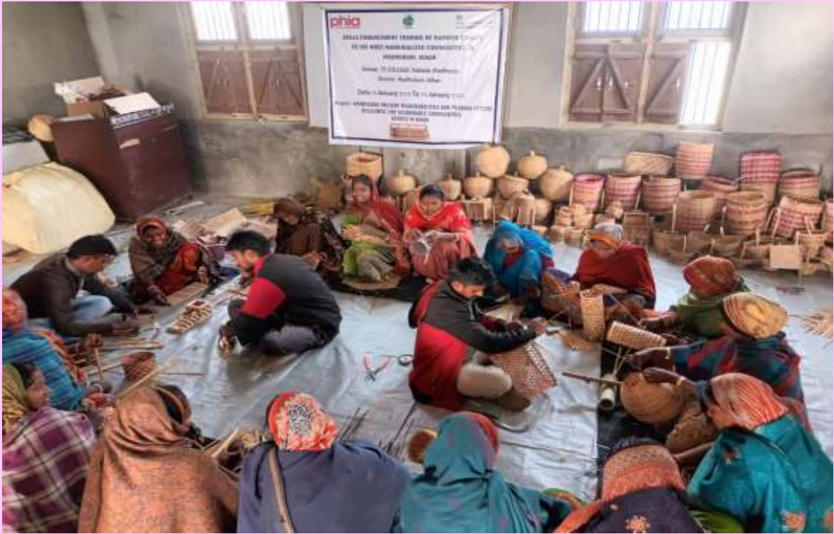
Participants learnt the using of Jigs and other tools for uniform production