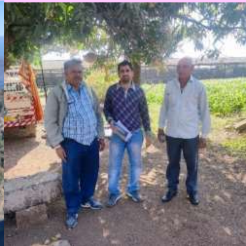
Progressive Bamboo Growing Farmer