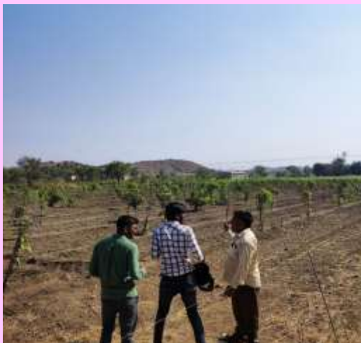
Bamboo Sticks for Plant Support at Gir Gidhada