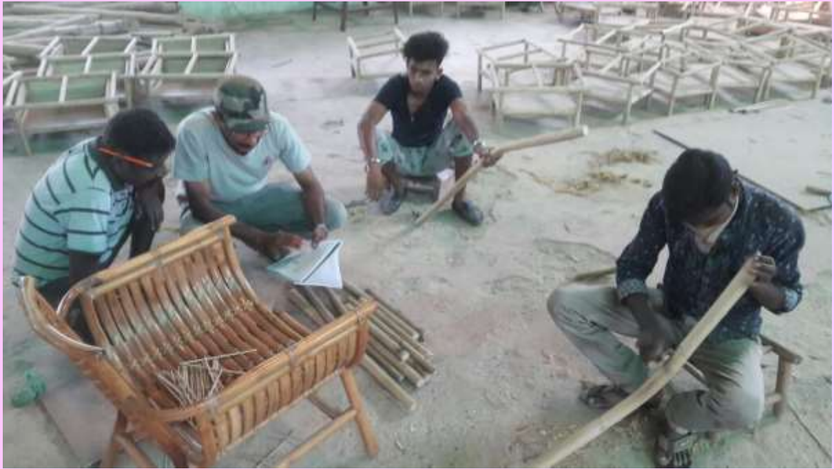
Bamboo Relaxing Chair