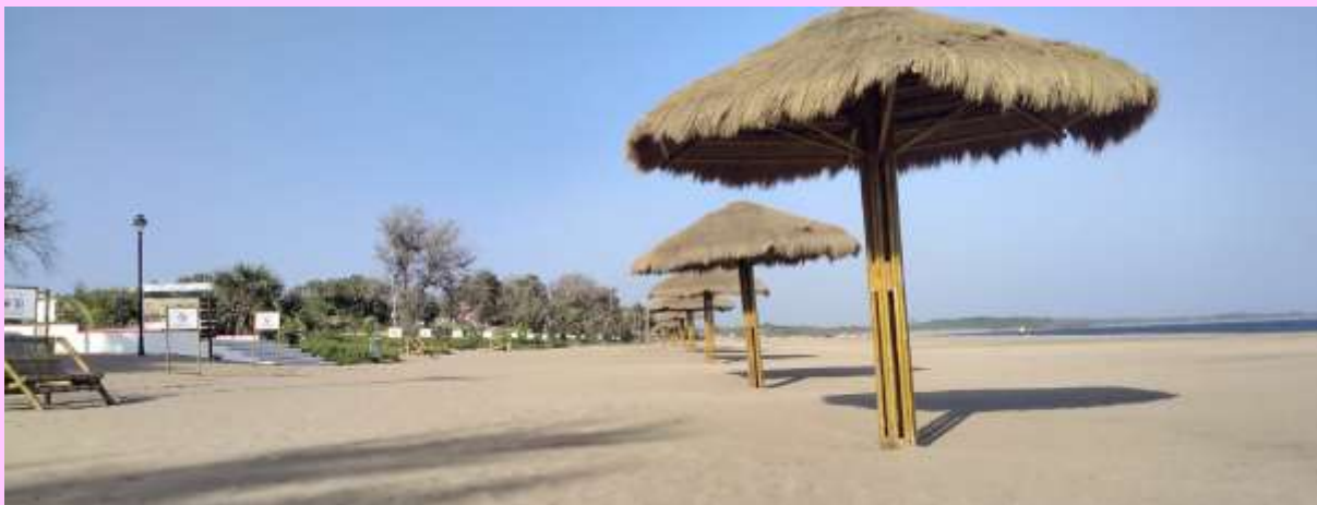
Bamboo Beach Umbrella