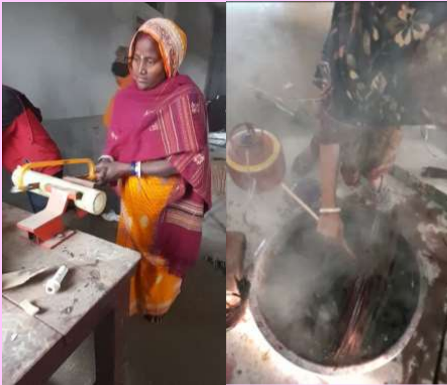
Participants used the improved tools, Hexa and colouring process of products.