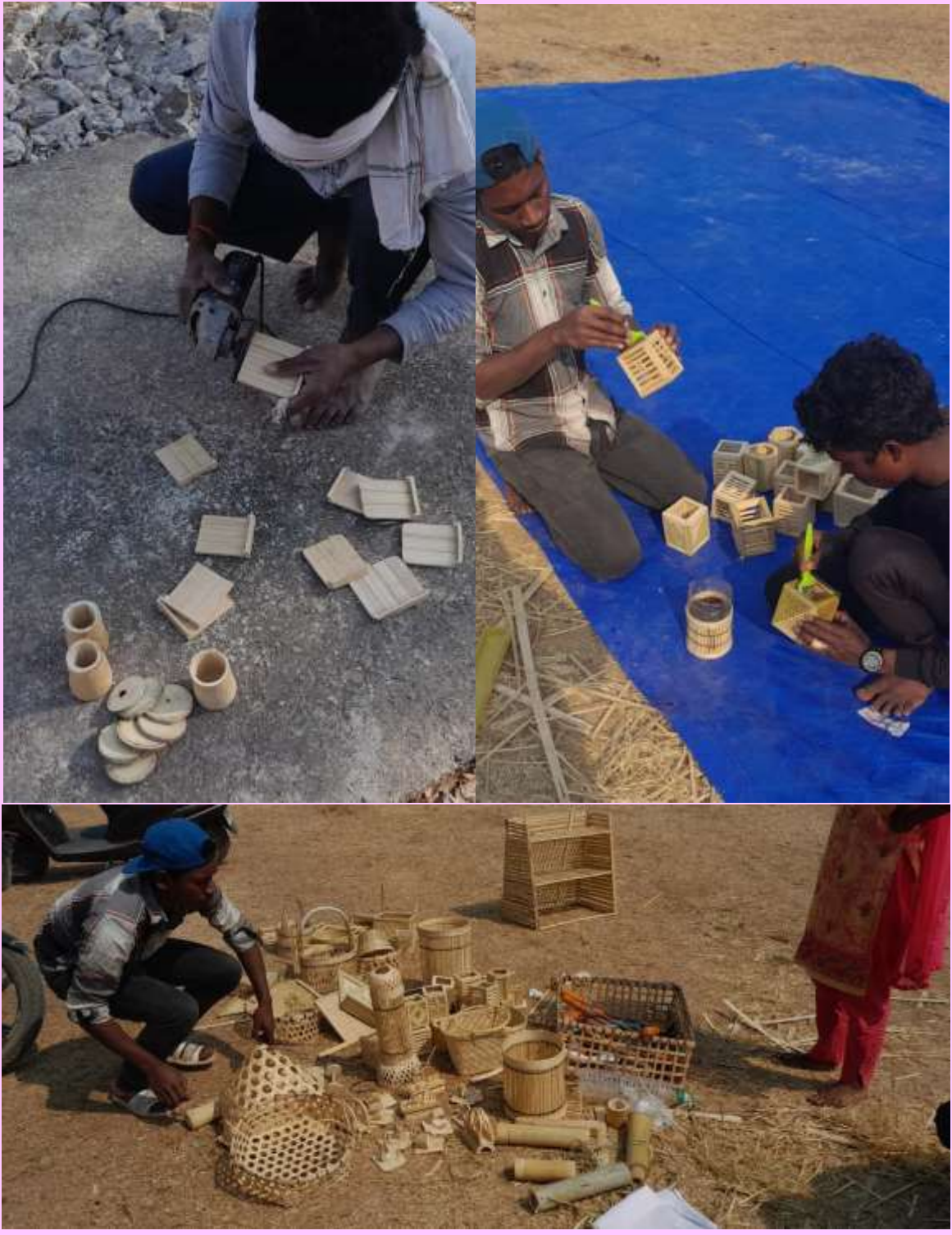
Product Finishing and Colouring