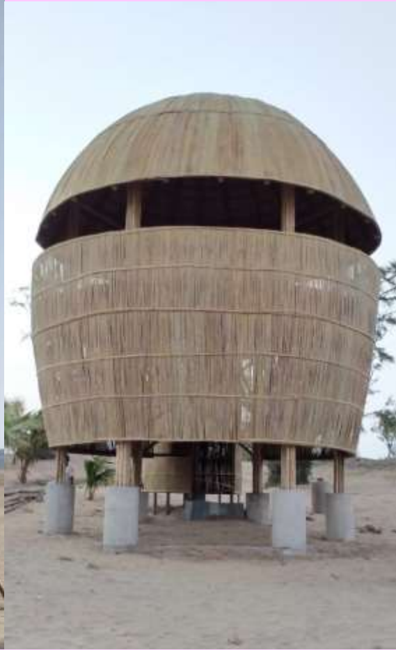
Bamboo Hut cum Watch Tower