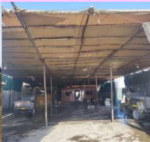
Bamboo Temporary Shop at Mangrol Beach