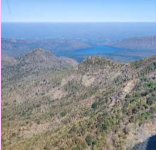
Gir Mountain without Bamboo

The Bamboo Value Chain and Feasibility Study for establishing a Common Facility Centre in Gir Sasan consisting of three districts mainly, Junagadh, Amreli and Gir Somnath this study was conducted during December to March 2023 for Aga Khan Agency for Habitat India, Mumbai, to explore the Scope and Feasibility of a Value Chain Alliance for use of bamboo in the building and construction sector. A survey was conducted where a total number of 110 farmers were interviewed from December 2022 - February 2023 to substantiate data available and provide an accurate assessment on the bamboo sector in all three districts. The survey was conducted in 42 villages in 23 blocks of all three districts.