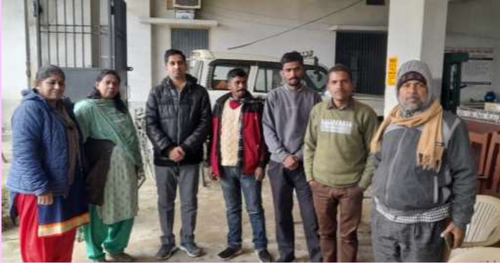
1 st Day of Training