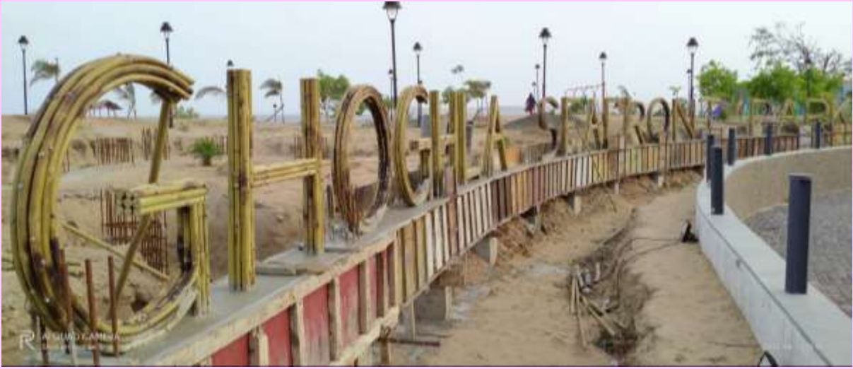
Bamboo Walls Decoration

Various Other Structures Prepared are as follows: