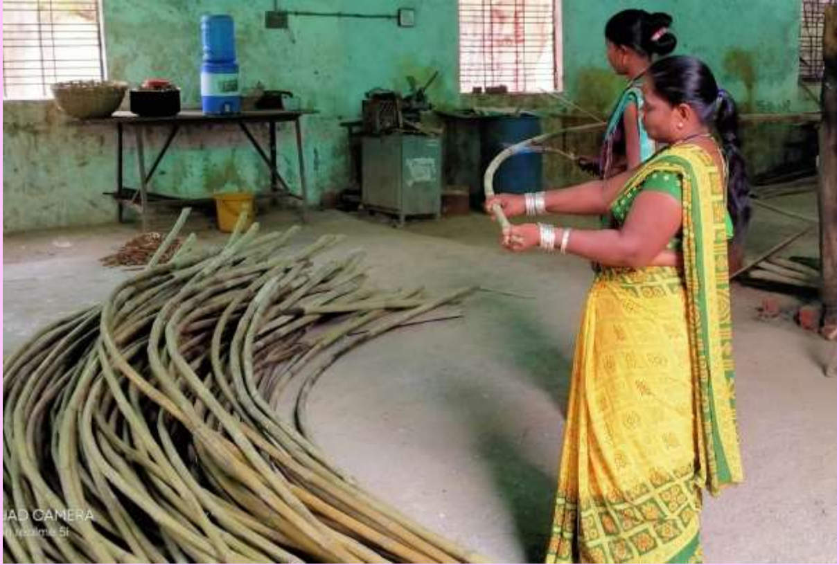
Bamboo Pole Bending