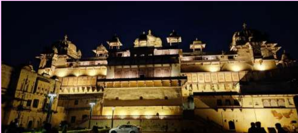
Orchha Fort in Night