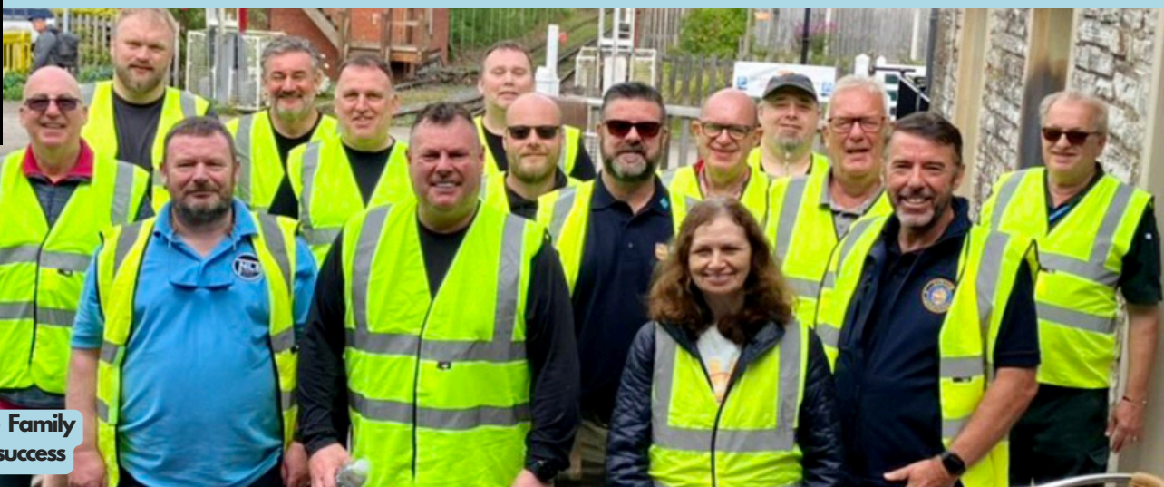
Our Featherstone Castle Family Fun Day proved a huge success