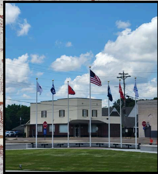
MUNFORD VETERANS PLAZA - MUNFORD, TN