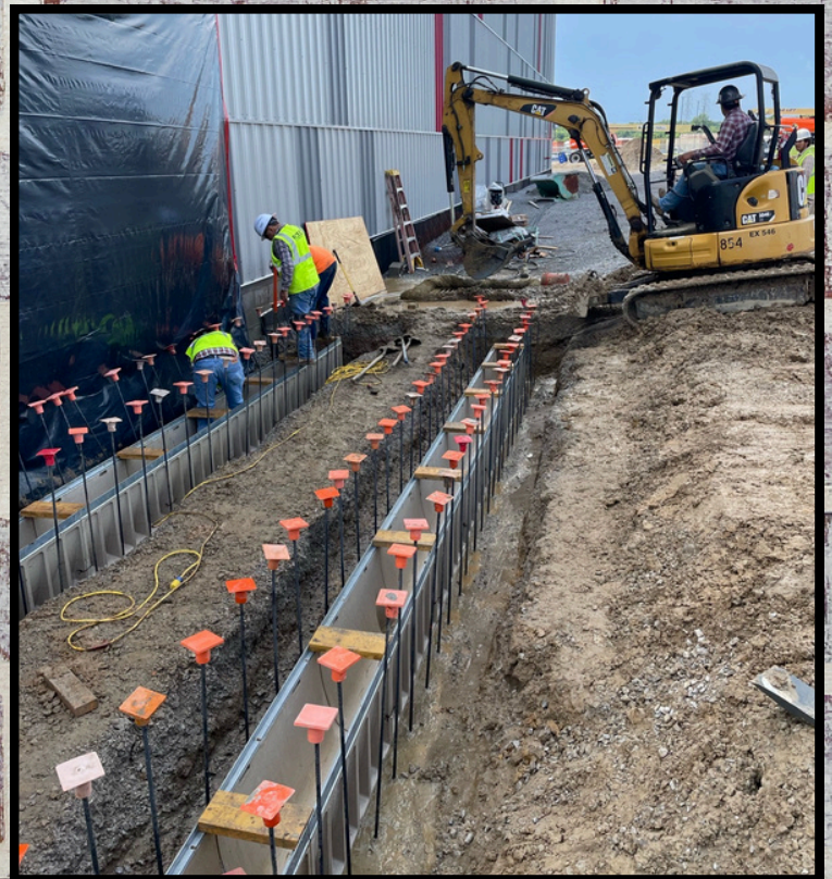
RIVIANA FOODS-MEMPHIS, TN