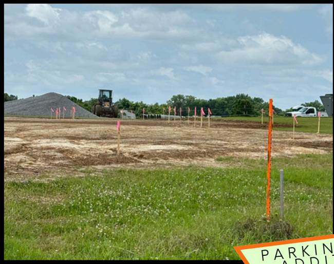
PARKING LOT ADDITION