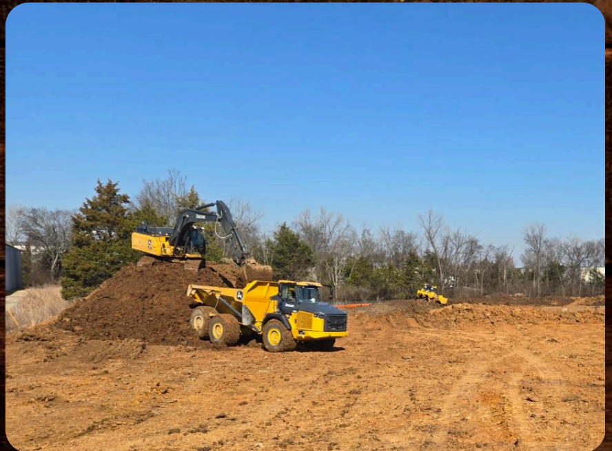
McCoy Lavergne Site Expansion Lavergne, TN