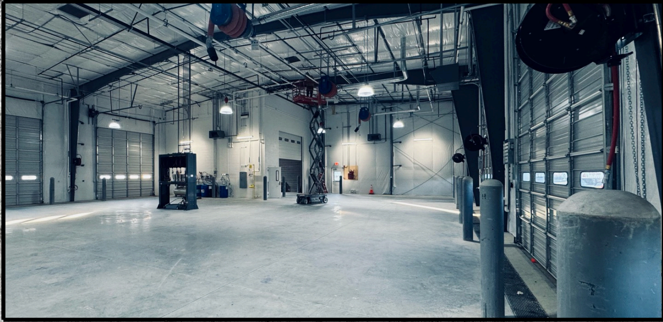
AWG Vehicle Maintenance Facility Hernando, MS