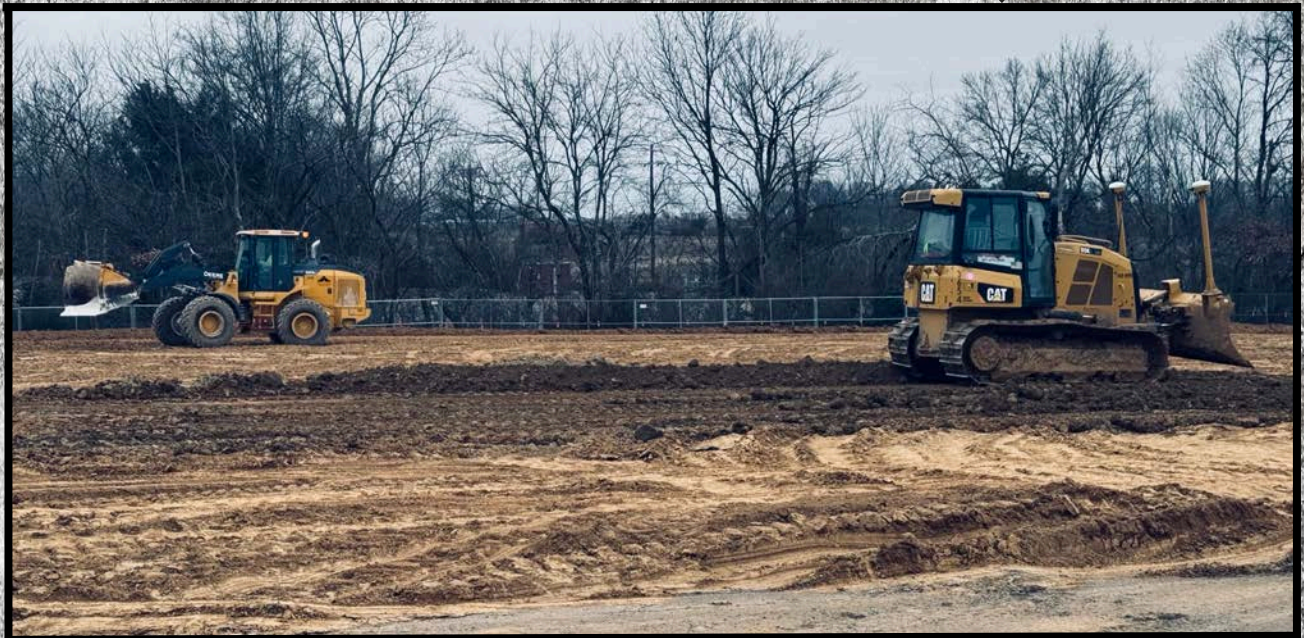
Catamount Hitachi East Loading Dock Alamo, TN