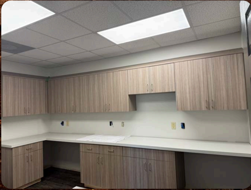
Twelvestone Infusion Center Maryville, TN