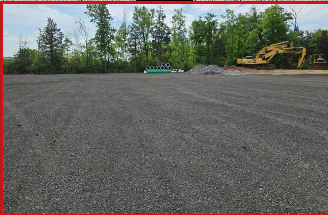
McGoy Lavergne Site Expansion - Lavergne, TN