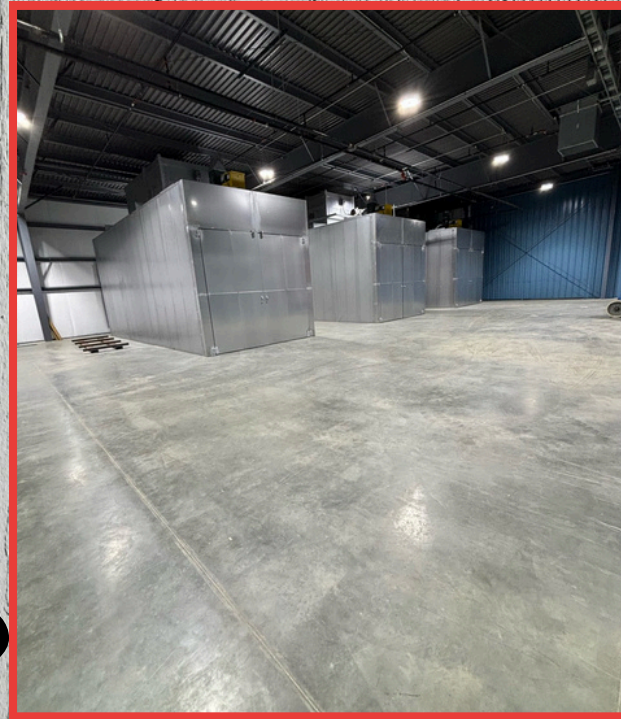
ERMCO - Dyersburg, TN