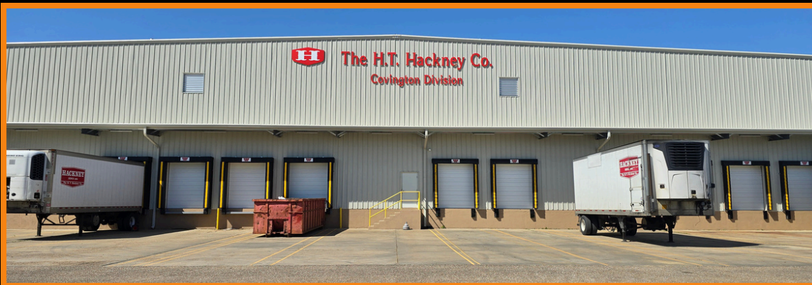
HT Hackney - Covington, TN