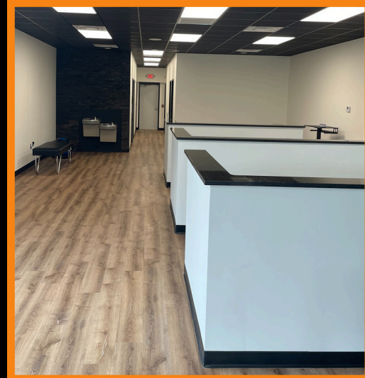
Thryve Chiropractic - Bartlett, TN