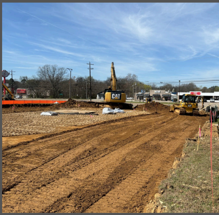
Captain D's Sitework - Covington, TN