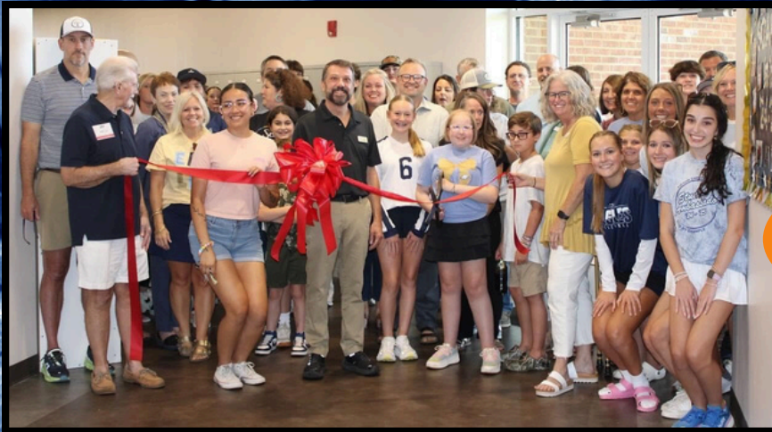
Tipton Christian Academy • Covington, TN