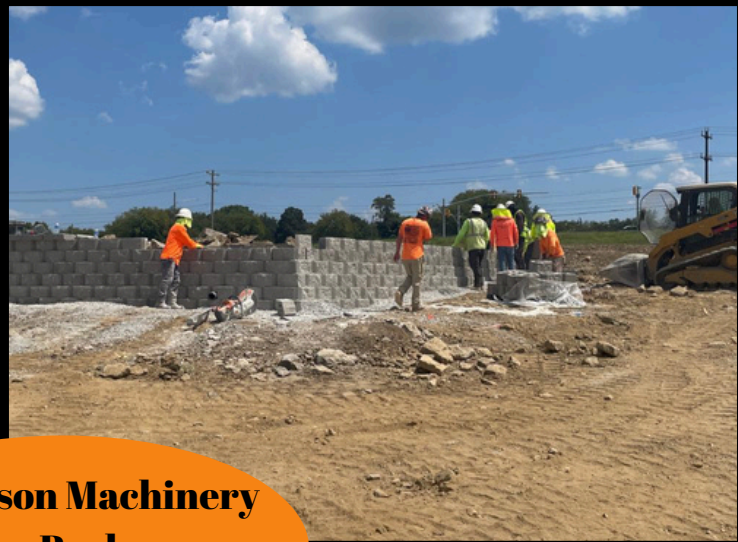
Thompson Machinery • Briley Parkway Nashville, TN