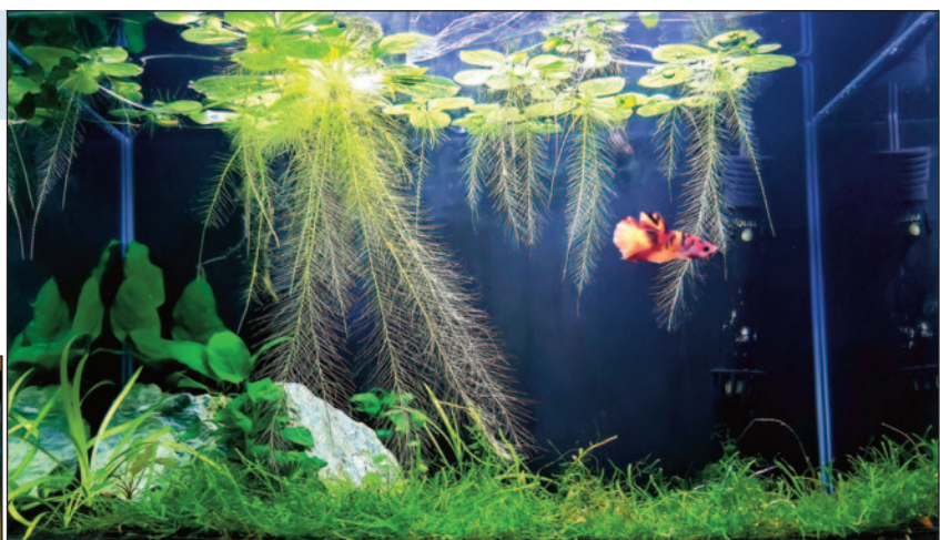
Above Molly aquarium First place Below Ben aquarium Second place