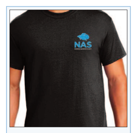
New NAS branded Apparel is coming. Tees, Hoodies and Polos will be available for order.