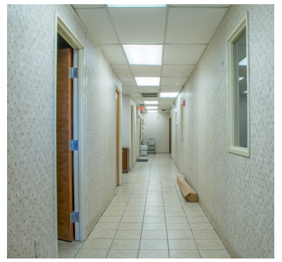
No warranty or representation is made for the accuracy or assumptions of the information contained herein. All information is subject to omissions, errors, price changes, prior sale, and/or withdrawal without notice. No liability is assumed for any inaccuracy of the information contained herein.