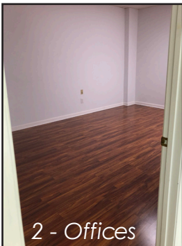
2 - Offices