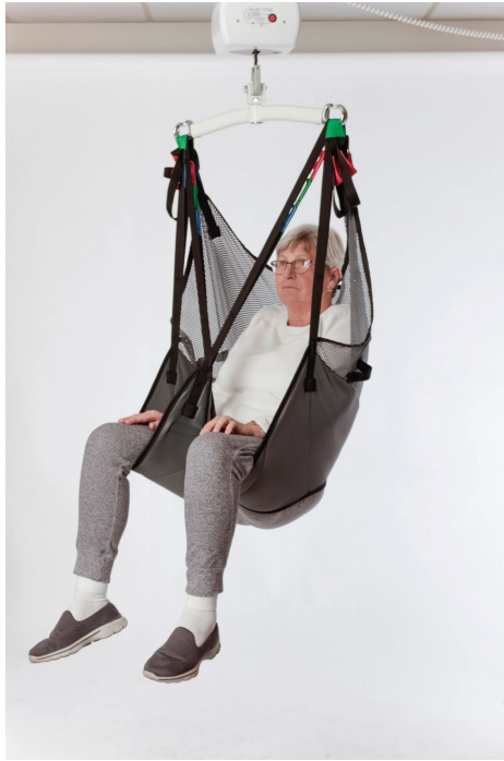
HighStar Patient Lifting Slings

Unique features that make HighStar slings stand out include: