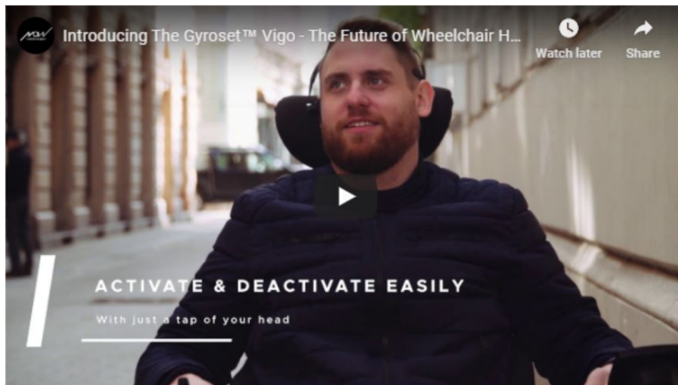
Introducing the Gyroset Vgo Video (Click to view)

Click on the image below to view an introductory video. More information is found on the E-W site .