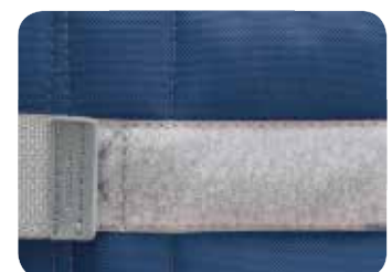
Blue Horizon Size 3a, 4