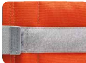
Orange Size 0a,1