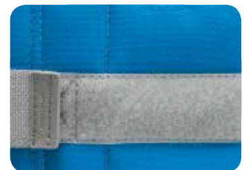
Blue Size 1a, 2