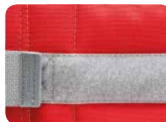
Red Size 2a, 3