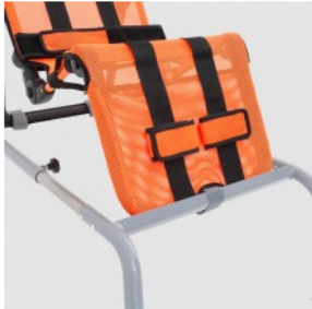
The belt system allows easy installation of the product on the basis ensuring safety during use