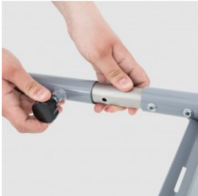
Easy to adjust length