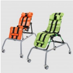
Product can be adjusted to fit all sizes of AKVOSEGO™ and AKVOLITO™ bath chairs