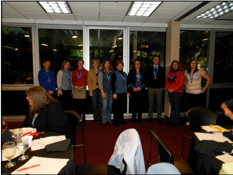
Gold Medal Winners