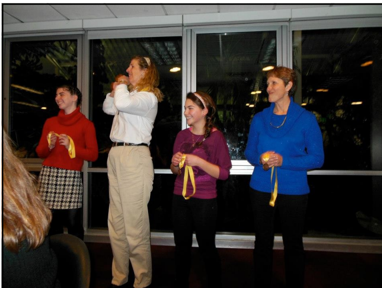
Bronze Medal Winners