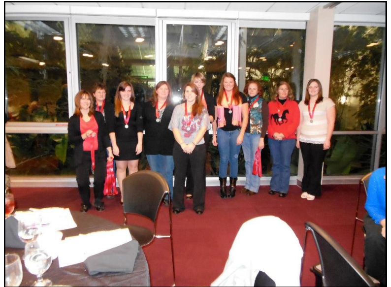
Silver Medal Winners