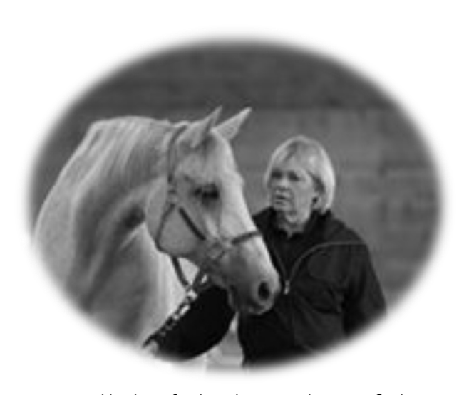
You need look no farther than your heart to find me.