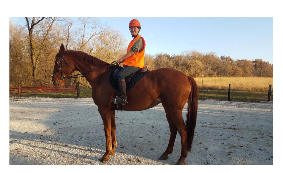
Stay Safe! Be Seen! Respect Others!

DEADLINE FOR SPRING COLLECTION MARCH15, 2021