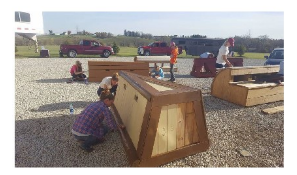
ISU Eventing painting jumps at local farm.

The lowa State Event Team has as its primary aim to encourage competitive riders in the discipline of eventing to continue competing while in college and after graduation. However, the organization will also offer social and educational opportunities (mounted and unmounted) to its members, and the local equestrian community. The Team has volunteered at local barns and plans to volunteer at events to help promote and support eventing and other equestrian disciplines.