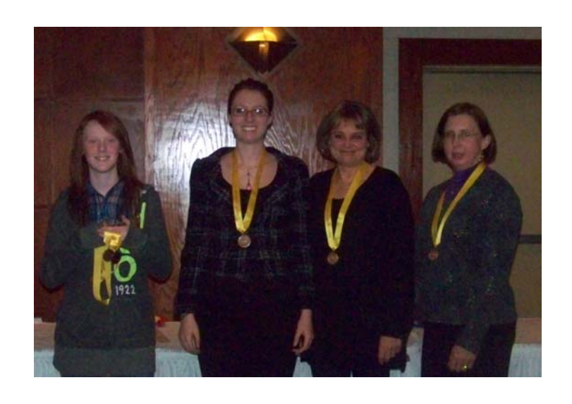
Good Job Bronze Medalists!