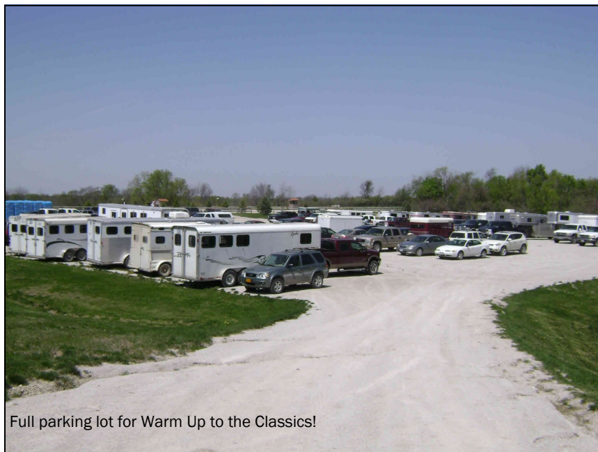
Full parking lot for Warm Up to the Classics!