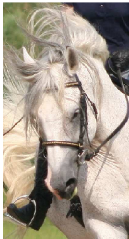
Lipizzan Stallion, Neapolitano Jurwela