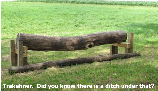
Trakehner. Did you know there is a ditch under that?