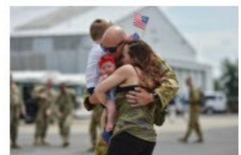
Soldiers return from a 11-month long deployment in Kosovo.