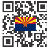
Arizona Elks Assn.