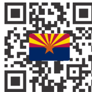
Arizona Elks Assn.