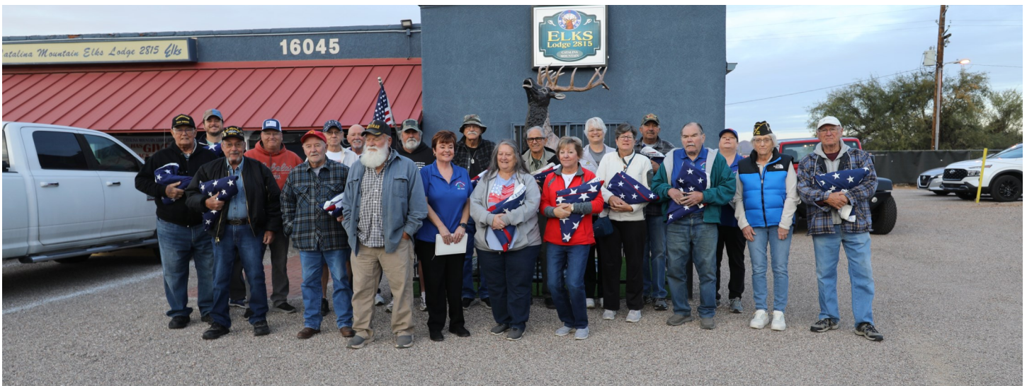
Flags up morning crew on Veterans Day

Lastly, Phyllis and I want to wish you all happiness, fun and love in the upcoming holidays.