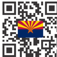
Arizona Elks Assn.