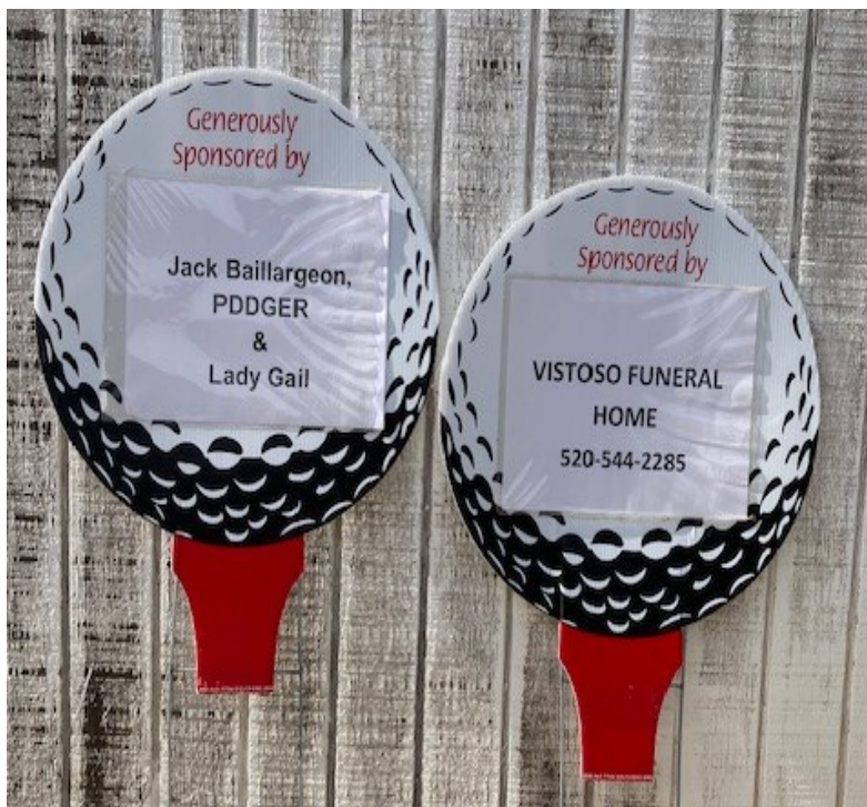
Hole Sponsorship Sign Examples

Examples of the signs are shown here. The entry form, on the next page, can be used even if you are purchasing a sign only and do not intend to