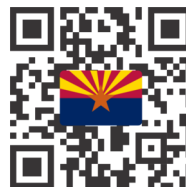
Arizona Elks Assn.