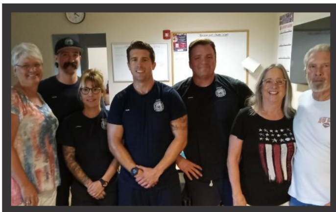
Station 373 SaddleBrooke