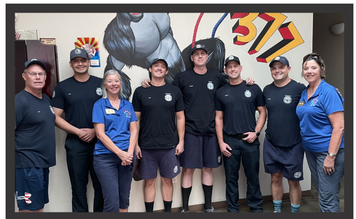
Station 377 Linda Vista