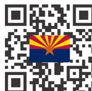
Arizona Elks Assn.