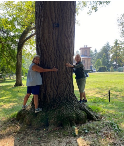
We're just a bunch of tree huggers.