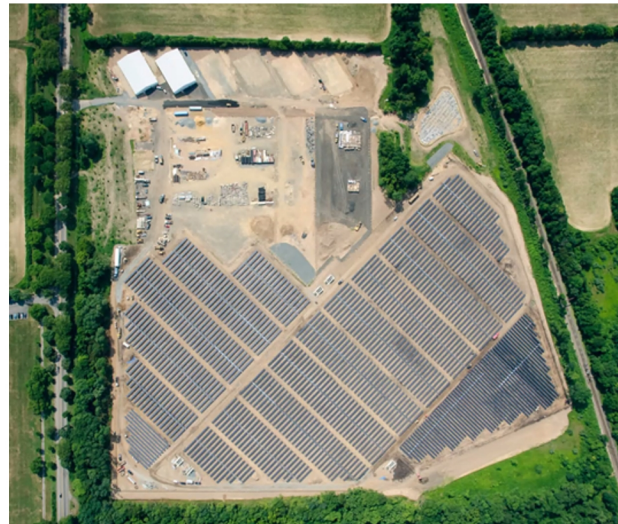
Princeton's Solar Panel Array