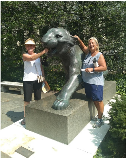
The Princeton Tiger