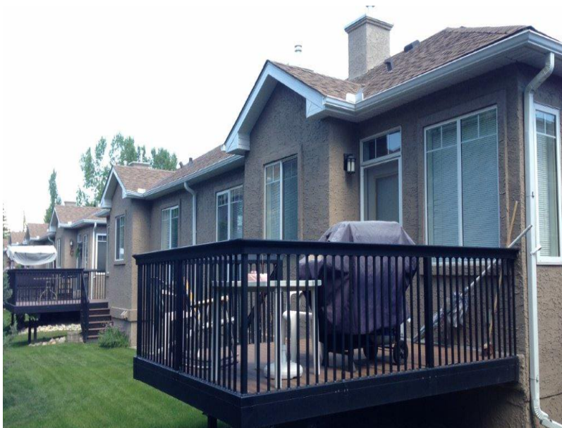
CCN 9710795 - Signal Hill Villas