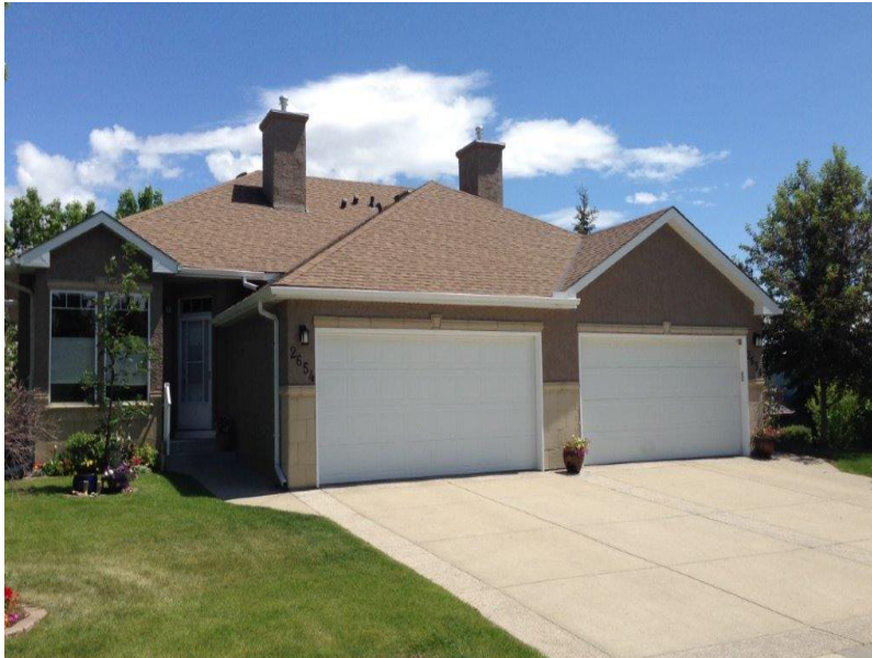
CCN 9710795 - Signal Hill Villas