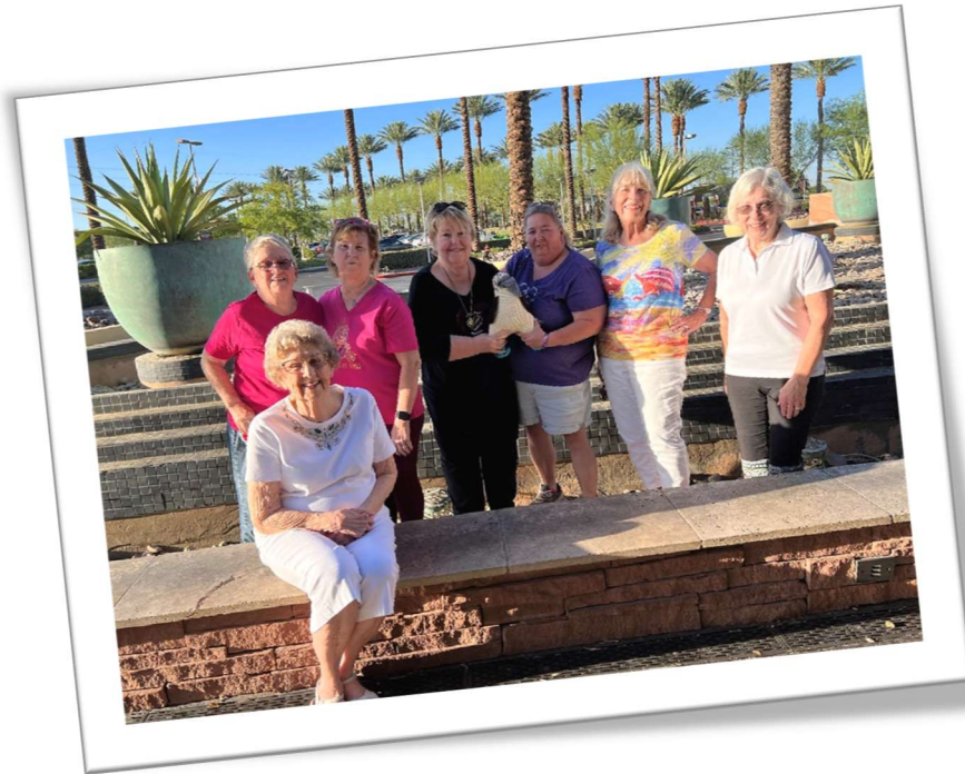
Zel Neva Ladies in Las Vegas