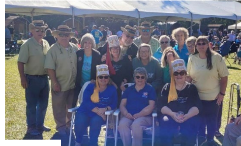
Khedive Shrine Chevy's (Chesapeake, VA) host an annual Cornhole Tournament in October. Zulekia Court #35's (Norfolk, VA) Grand High visit happened to be the same time frame. The Chevy's asked the Ladies to attend & introduced them.