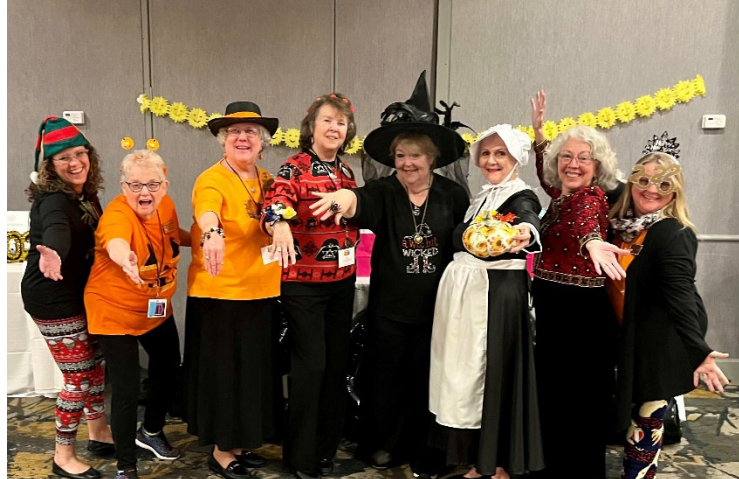
Some of your Grand Officers enjoying themselves at the "Celebrating the Holidays" Fun Night Dinner at MSUM.

Second edition of the Grand Council Gazette