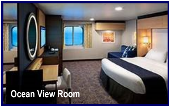
Ocean View Room