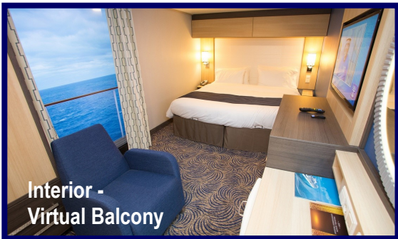
Interior - Virtual Balcony